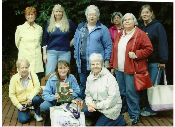
Photo of some Chapter members that met in the sale area.